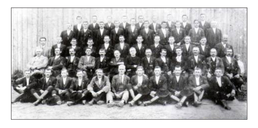
The Men's Guild of Mosonsetpeters in the 1930s 35