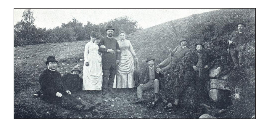
The decision to found the Hungarian Tourist Association on an excursion 27

The circular of Kálmán Tisza, Minister of the Interior No.1508/1875 BM. prohibited the establishment of political associations for nationalities, they could only establish literary and public cultural institutions, while workers' associations were prohibited from establishing branch associations: "and associations with essentially different purposes may not be formed under one title with common statutes". The spirit of the decree was still similar to that of 1873, but the detailed regulations already contained a number of restrictive elements.